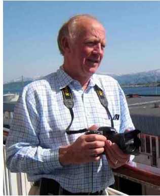
Photography – a lifelong hobby

As I have already had brief reports on my fellow directors I feel I should make a similar contribution to the publication that I am lucky enough to edit, others have also said I must be even handed.