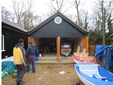
The fleet goes under cover for the winter

The final cost of our new building is expected to be in the region of £28,000 but the replacement cost would be in excess of £40,000. Local and national companies have donated materials and local craftsmen have given their time free of charge to help us develop an excellent facility of outstanding quality. The contribution of all those who have made it possible will be recognised on the 'Donors and Supporters Board' which will be unveiled at the official opening. There is insufficient space in this edition to name all those who have contributed to the project, but donated materials from roofing felt to solid oak doors and from scaffolding to roof trusses are all excellent examples of the goodwill that has made this project such an outstanding success.